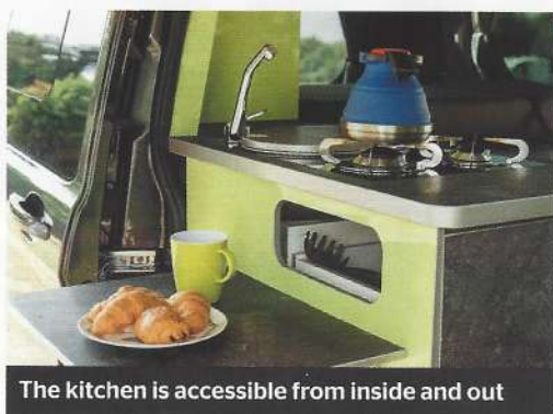
The kitchen is accessible from inside and out