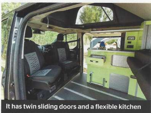
It has twin sliding doors and a flexible kitchen